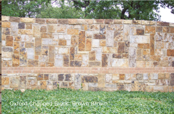
Oxford Chopped Block Brown Brown

UNIVERSITY SERIES OXFORD and STANFORD SANDSTONE